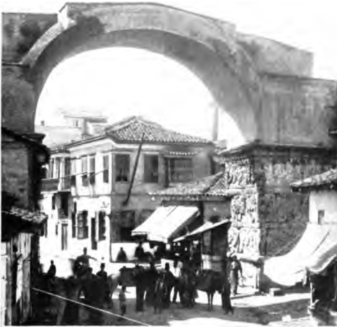
TRIUMPHAL ARCH, SALONIKA